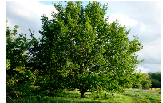
The climbing tree