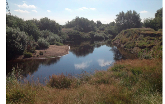
Old Ees Brook

5 Blue Corridors: The pond and ditches provide valuable habitat for dragonflies such as common and southern hawkers. Aquatic plants such as brooklime provide cover for tadpoles and other amphibians. Clusters of meadowsweet can be seen flowering throughout summer.